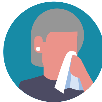
Cover coughs and sneezes