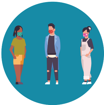
Cover your mouth and nose when around others