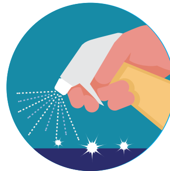
Clean and disinfect frequently touched surfaces