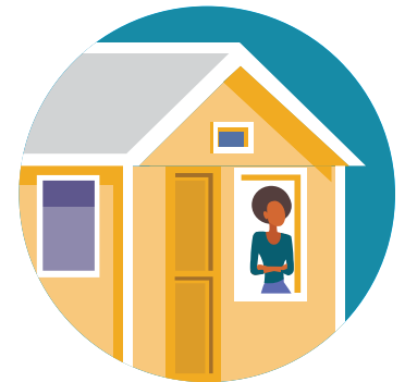
Avoid close contact with people who are sick