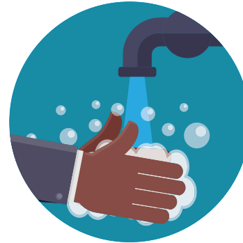
Clean your hands often with soap

We care deeply about the safety of our campus community. If you feel sick, do not come to campus. Remember that some people without symptoms may be able to spread the virus.